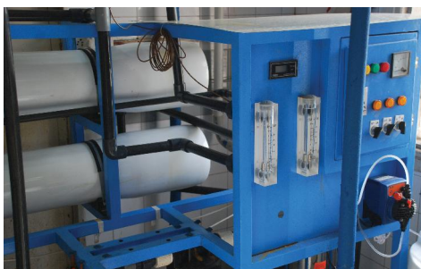
New Reverse Osmosis plant for drinking water