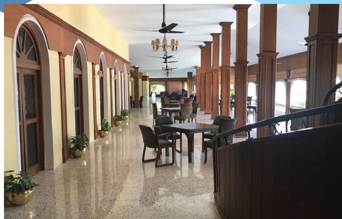
New and Old for the main lobby and floor