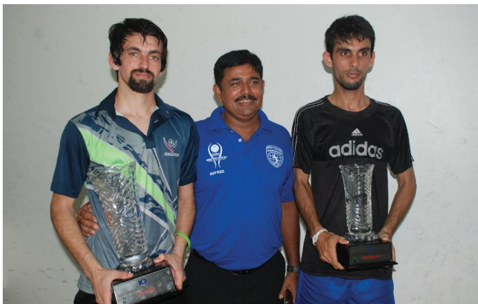
Winners of Squash Tournament