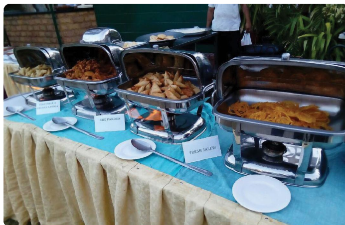
Hot and crispy, sweet jalebis a club favourite among others