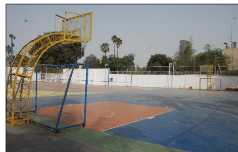
Basketball and Football ground redone