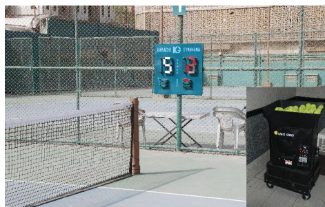
New Scoreboard and ball machine