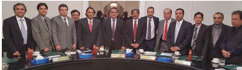
Karachi Gymkhana President and Managing Committee for 2017