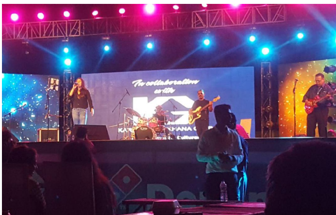
Atif Aslam, Zoe Viccaji and Asim Azhar Concert