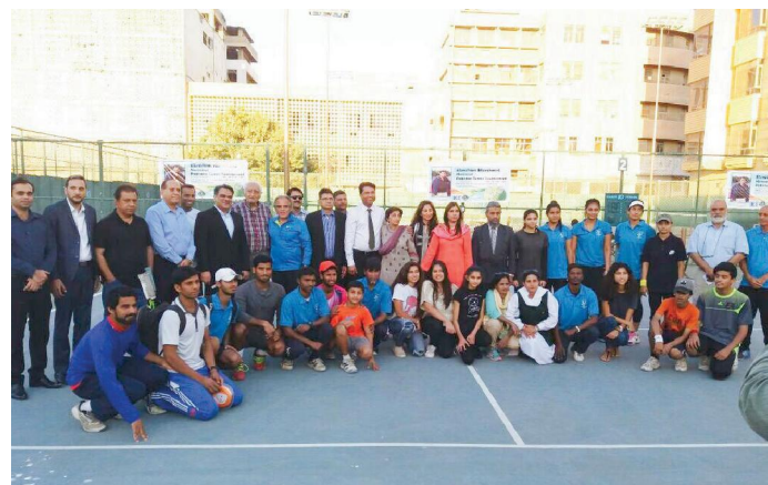
Ebrahim Merchant Tennis Tournament