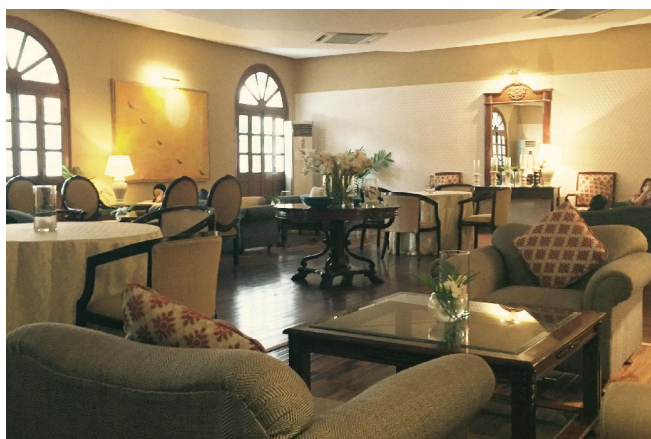
Newly launched Palm Court Tea Room

The "Palm Court Tea Room" was conceived by the President enabling members to enjoy their cup of tea in a serene atmosphere. The soft and somber ambiance of the new tea room can be enjoyed by ordering a very elegant Tea Tier laden with scrumptious goodies and a variety of teas at nominal rates. Since its opening, it's a favorite hot spot for many distinguished members. The Tea Room is ideal for kitty parties, casual business meet-ups or relaxing with friends. Open to members and guests above 15 years of age.