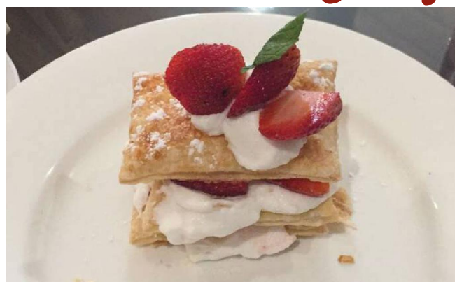
Shamira's celebration of the strawberry season