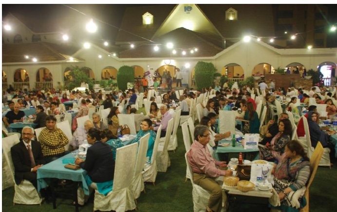
First Grand Quiz Rama 2017