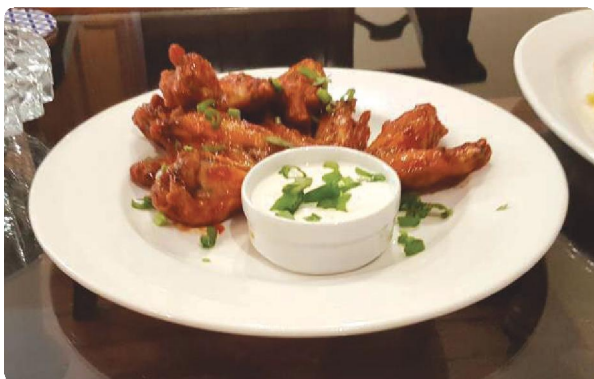
Chicken Wings available at Sam's Snack Bar