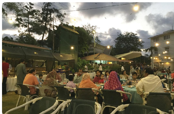
Hundreds of members enjoyed Sehri and Iftaar in the club lawn